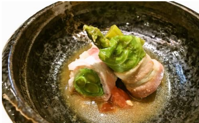
Bacon Wrapped Cabbage & Asparagus in Wafu Tomato Dashi $5.5