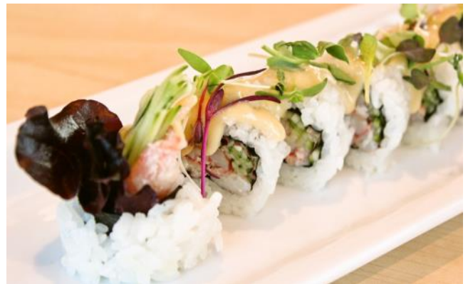
Spring Crab Roll Crab legs, carrots, cucumber, Asian mix, lettuce, topped with sweet miso mayo sauce $18