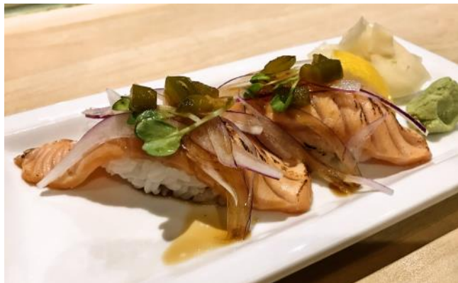
Seared Salmon Nigiri with Poke Sauce $8