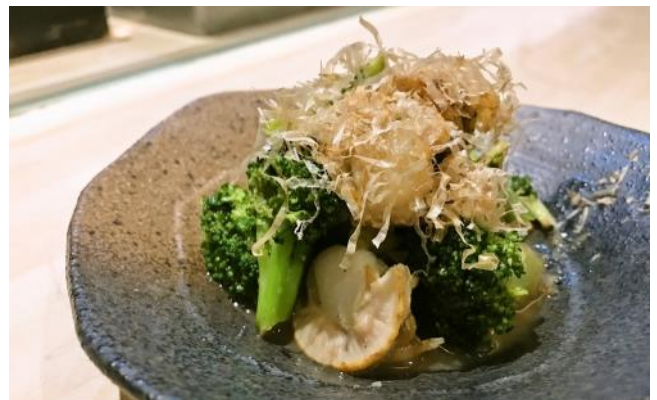
Broccoli and baby scallops in garlic butter ponzu sauce $6.5